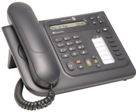
Alcatel-Lucent IP Touch 4008EE/4018EE Phones

The Alcatel-Lucent IP Touch™ 4008/4018 Extended Edition (EE) phones are cost-effective, entry-level desk phones that offer integrated IP connectivity and basic telephony.